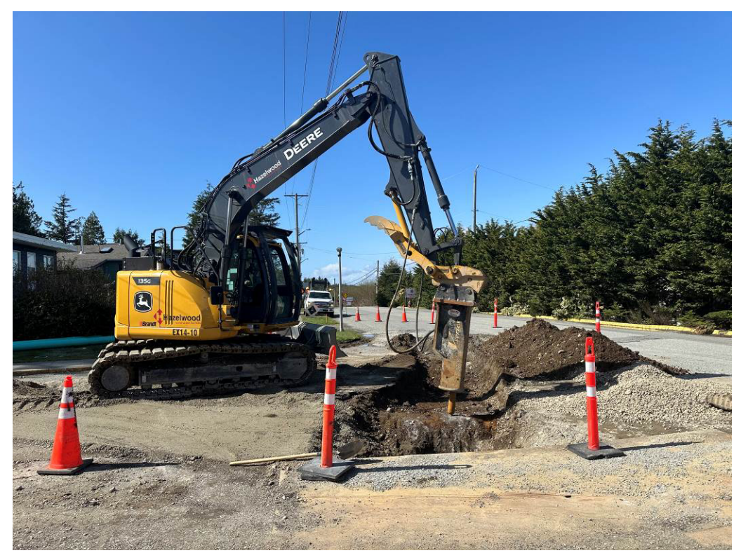
Photo #3 – Rock Removal Completed for Bay Street Drainage Improvements